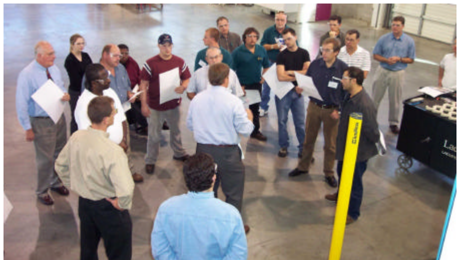
CMI Course participants enjoy their tour of the Laempe + Reich facilities.